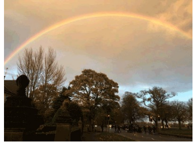
Rainbow over Harrogate Stray.