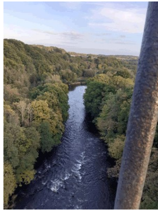
Aqueduct over the Diver Dee