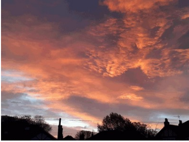
View from Stray Walk at 6.30 am. 'You can't beat nature for beauty-