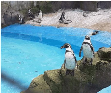
Penguins at Harwood House

Please don't hesitate to volunteer if you would like to share your choices with us.