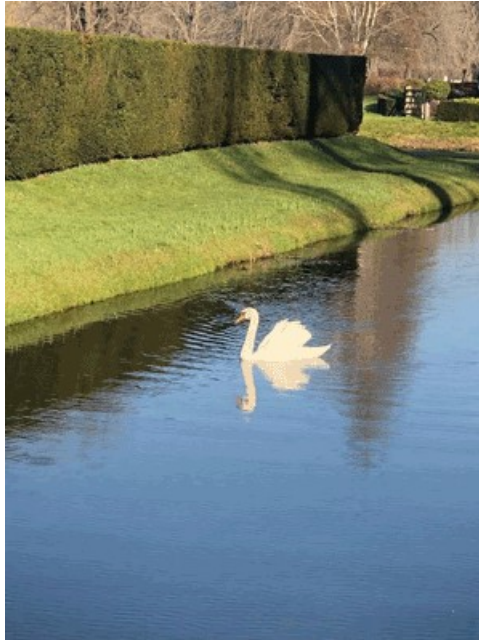
A swan swimming at Hever Castle by Ian