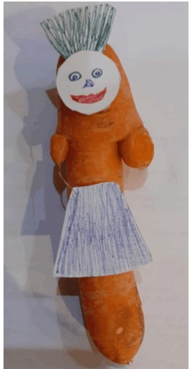
Sudron carrot family