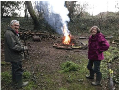
'Smoke gets in your eyes'