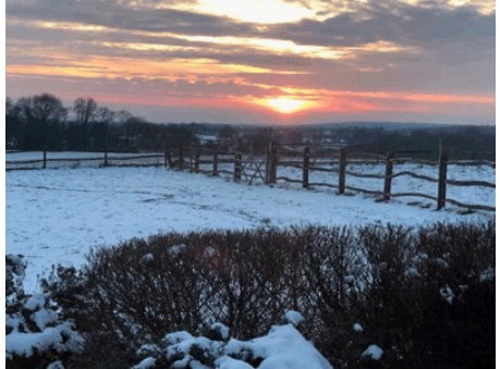
Sunset over Gatwick