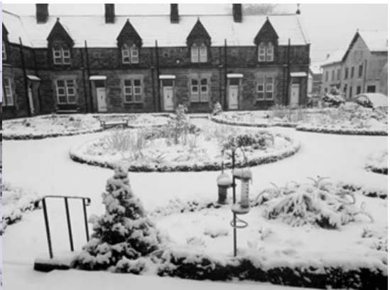
Lynne sent in these lovely pictures taken from her front door.