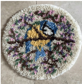
Left: Ann's cushion cover