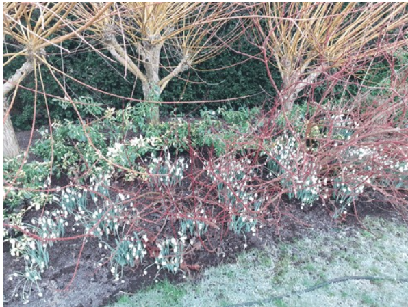
Snowdrops in Harlow Carr Gardens on 2 January