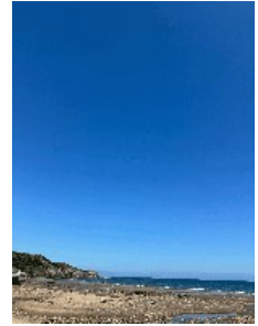
Eileen and Ian went for a walk along the beach from Whitby to Sandsend. When they started it was misty and cold, but less than an hour later they had this beautiful blue sky.