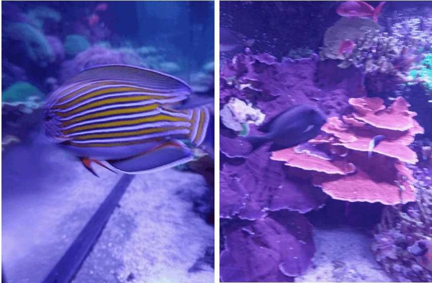
Photographs by Barbara Lister following a visit to the London Aquarium