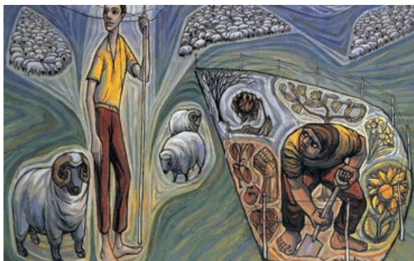
John Reilly - Cain and Abel from the Methodist Modern Art Collection © TMCP, used with permission. www.methodist.org.uk/artcollection

You can view those works online in the collection that are not restricted by copyright. https://www.methodist.org.uk/faith/the-methodist-modern-art-collection/browse-the-collection/