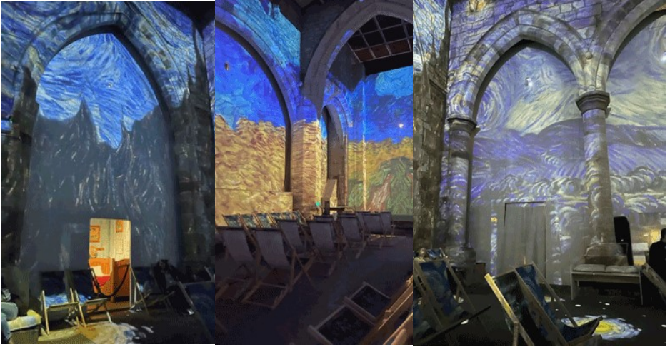
Van Gogh Immersive Experience at York St. Mary's Church