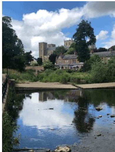
Ian took this photograph of Ripon Cathedral.