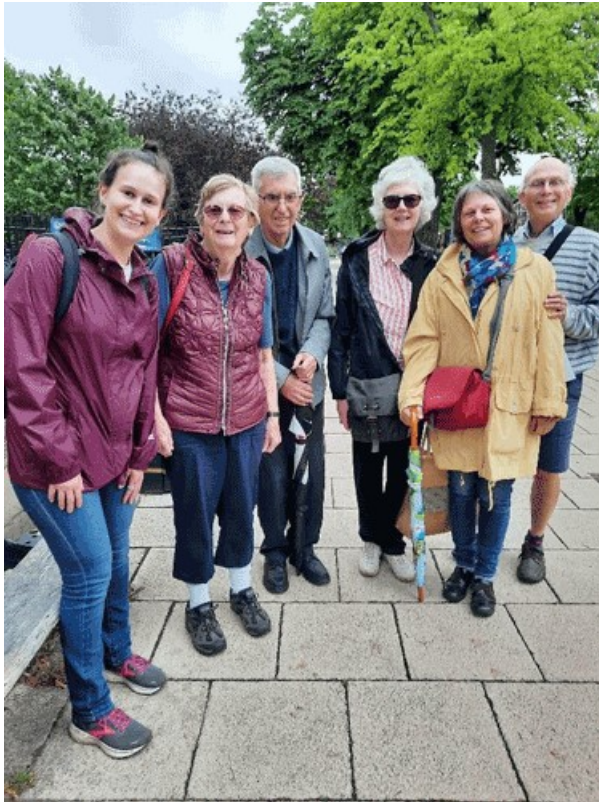
A Guided Tour (see p9)