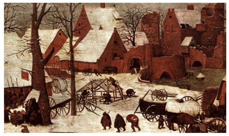
Detail of ruined castle from The Census in Bethlehem (front cover)