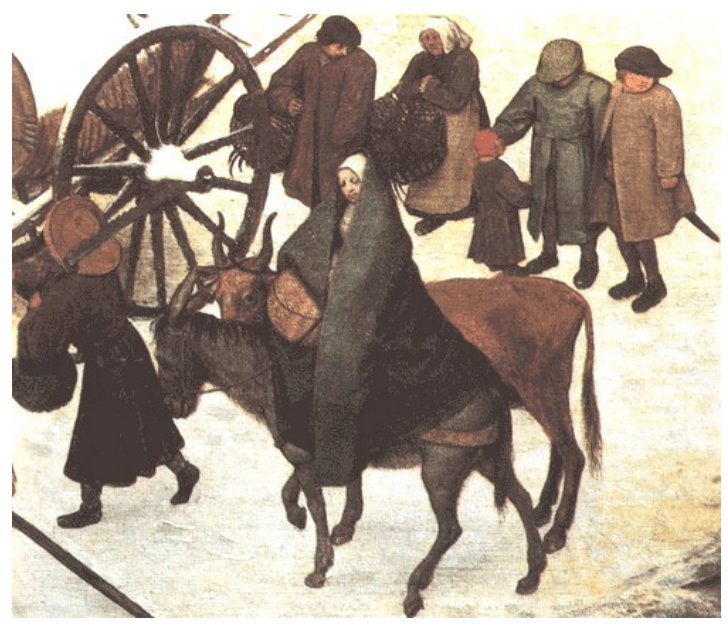
Detail of Mary & Joseph from The Census in Bethlehem (front cover)