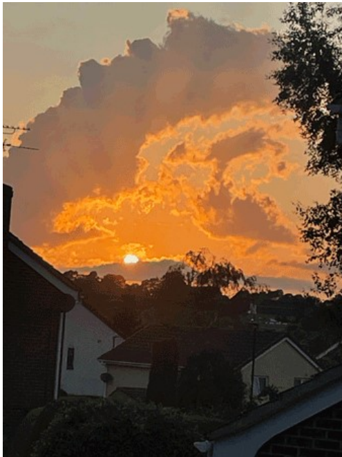
Sunset at Killinghall Moor. (JY)