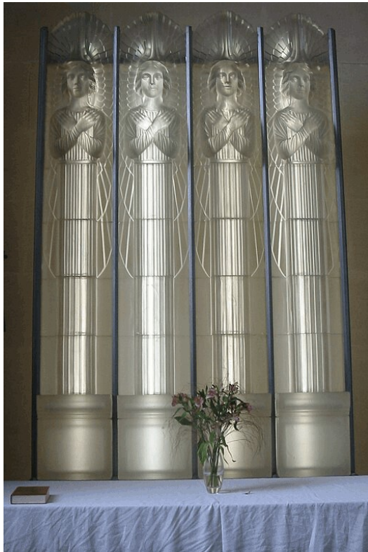
Glass altarpiece by René Lalique in St. Matthew's Church (the Glass Church), Millbrook, Jersey

René Jules Lalique (6 April 1860 – 1 May 1945) was a French jeweller, medallist, and glass designer known for his creations of glass art, perfume bottles, vases, jewellery, chandeliers, clocks, and automobile hood ornaments