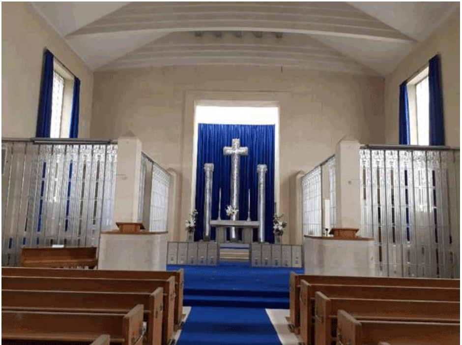
St. Matthew's Church. (The Glass Church), Millbrook, Jersey.