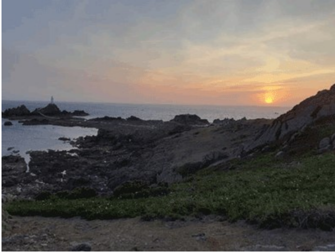
Le Corbiere lighthouse Jersey. (CS)..