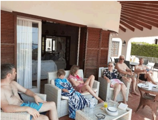
Left. Cate took this picture of a family gathering in the shade! Children had just got out of the pool.