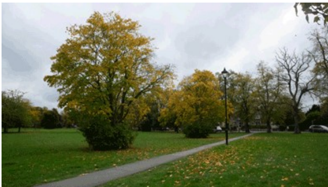
Autumn comes to the Stray.